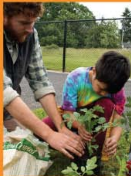
- School Garden Project Grantee